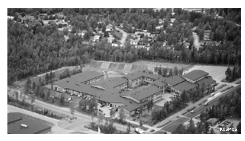
Kosmos Technology Tietokatu 1 FI-94600 Kemi Finland