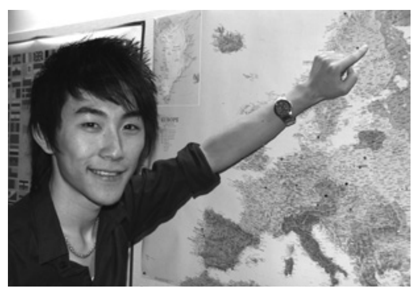
INFORMATION ON THE INSTITUTION... • 7