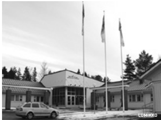
Lumikko Administrative Services Lumikontie 2 FI-94600 Kemi Finland