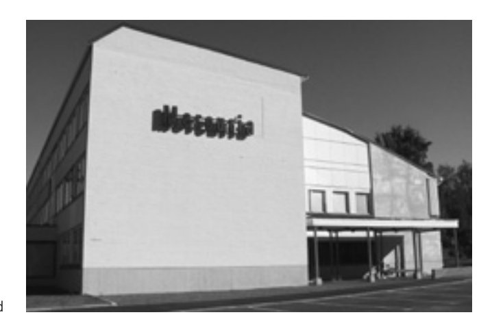
Kemi-Tornio University of Applied Sciences BUSINESS & ICT Kauppakatu 29 FI-95400 Tornio Finland